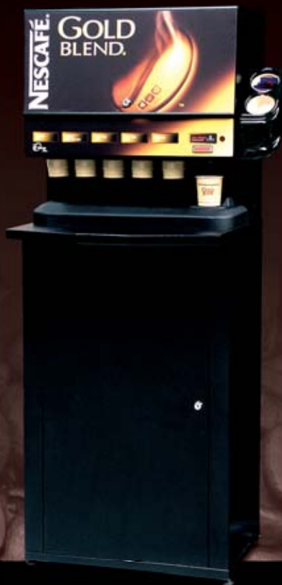
5 selection (manual) Minicup Flex shown with matching base cabinet

This remarkable little machine features a highly flexible specification enabling it to be easily customised to meet individual requirements.