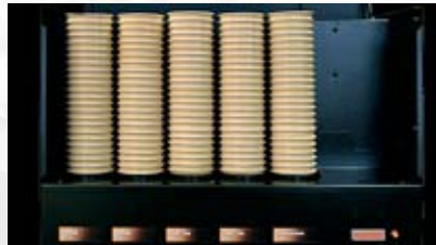
Internal view of 5 selection (manual) machine

The Minicup Flex by DarenthMJS provides an ideal solution for the smaller user who requires a simple and extremely cost effective vending solution. This remarkable little machine features a highly flexible specification enabling it to be easily customised to meet individual requirements.