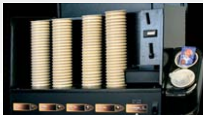
Internal view of 4 selection (automatic) machine