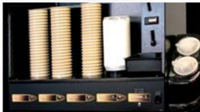
Internal view of 3 selection plus internal sugar machine

The Minicup Flex is available in a range of graphics and branding options. Please ask your DarenthMJS authorised dealer for latest details.