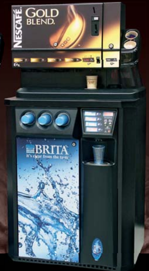
4 selection (automatic) Minicup Flex shown with side mounted electronic sugar dispenser and partnered with the WaterBoy rehydration station